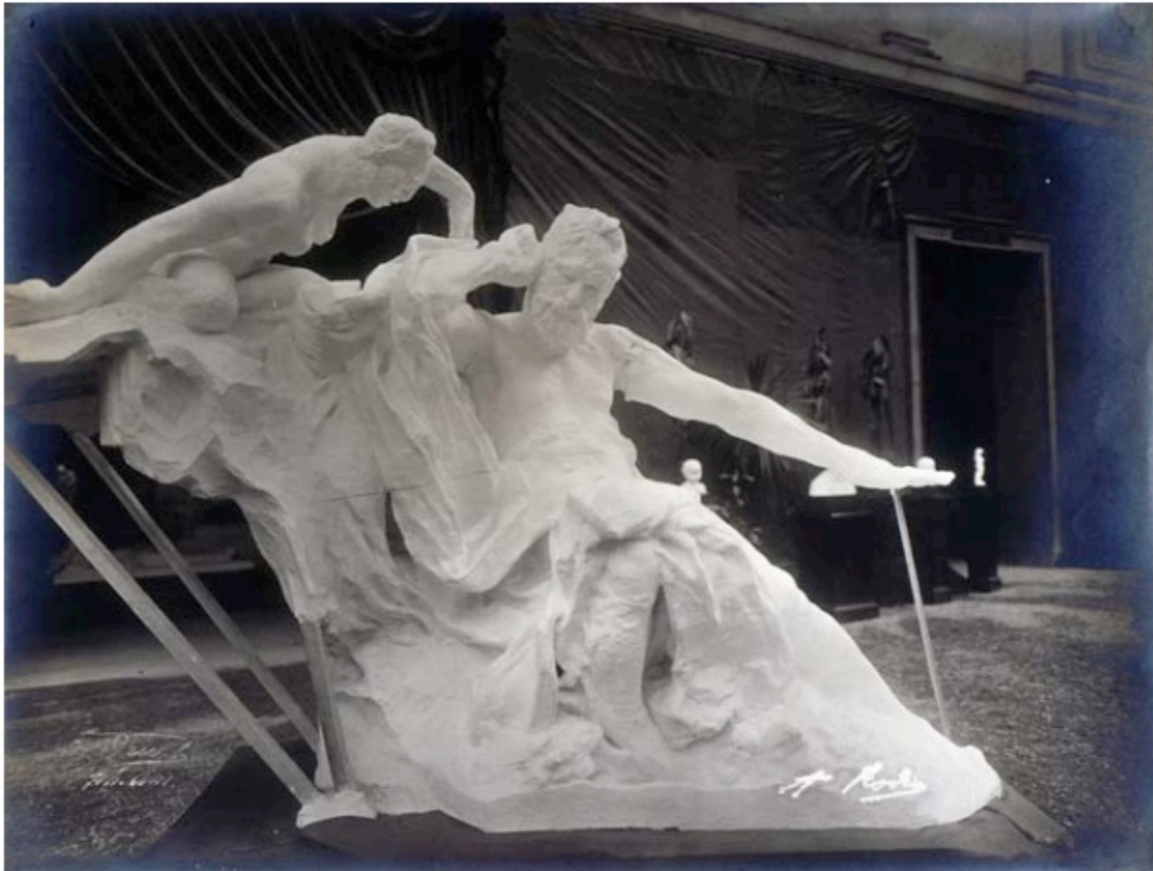
Monument to Victor Hugo at Salon de la Société nationale des Beaux-Arts, circa 1910, [Ph.00007]

Rodin in front of his collection of [Ph.00007]