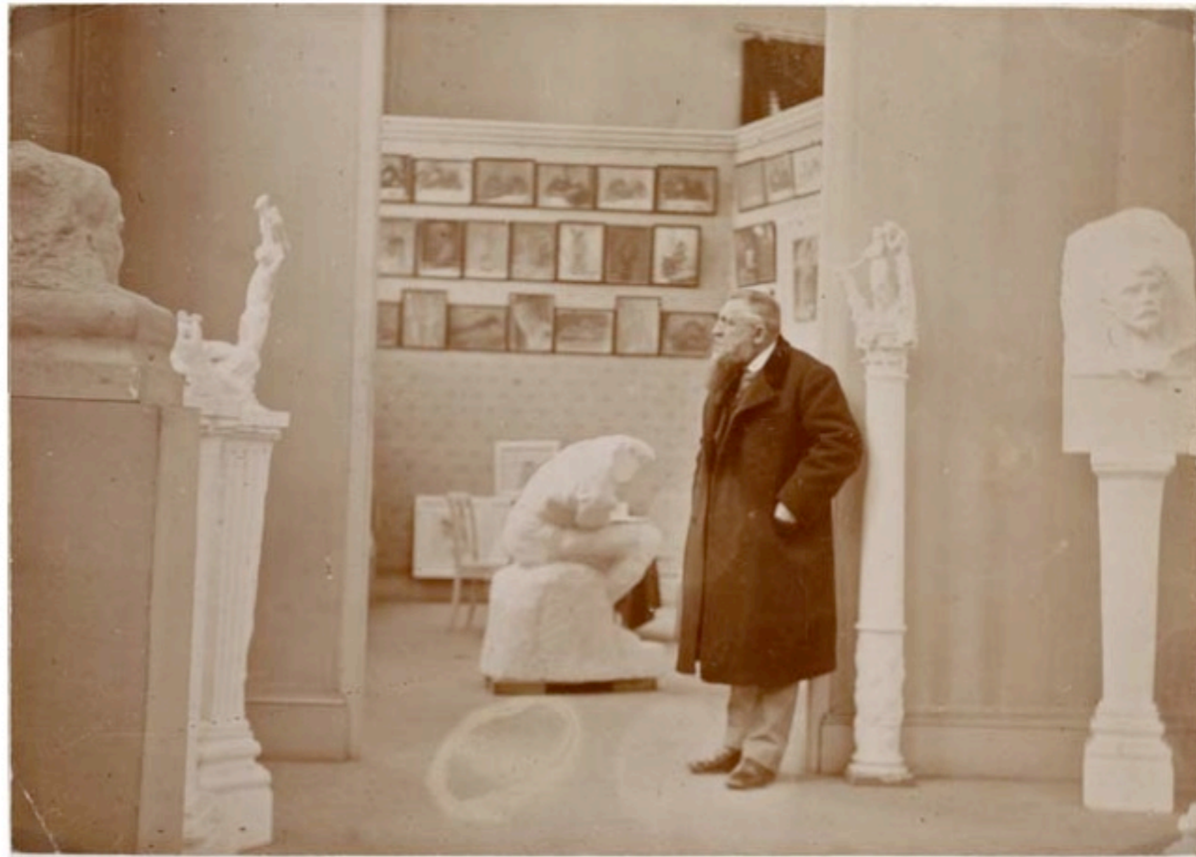
M. Bauche, Rodin in the Pavillon de l'Alma, 1900, [Ph.00790]