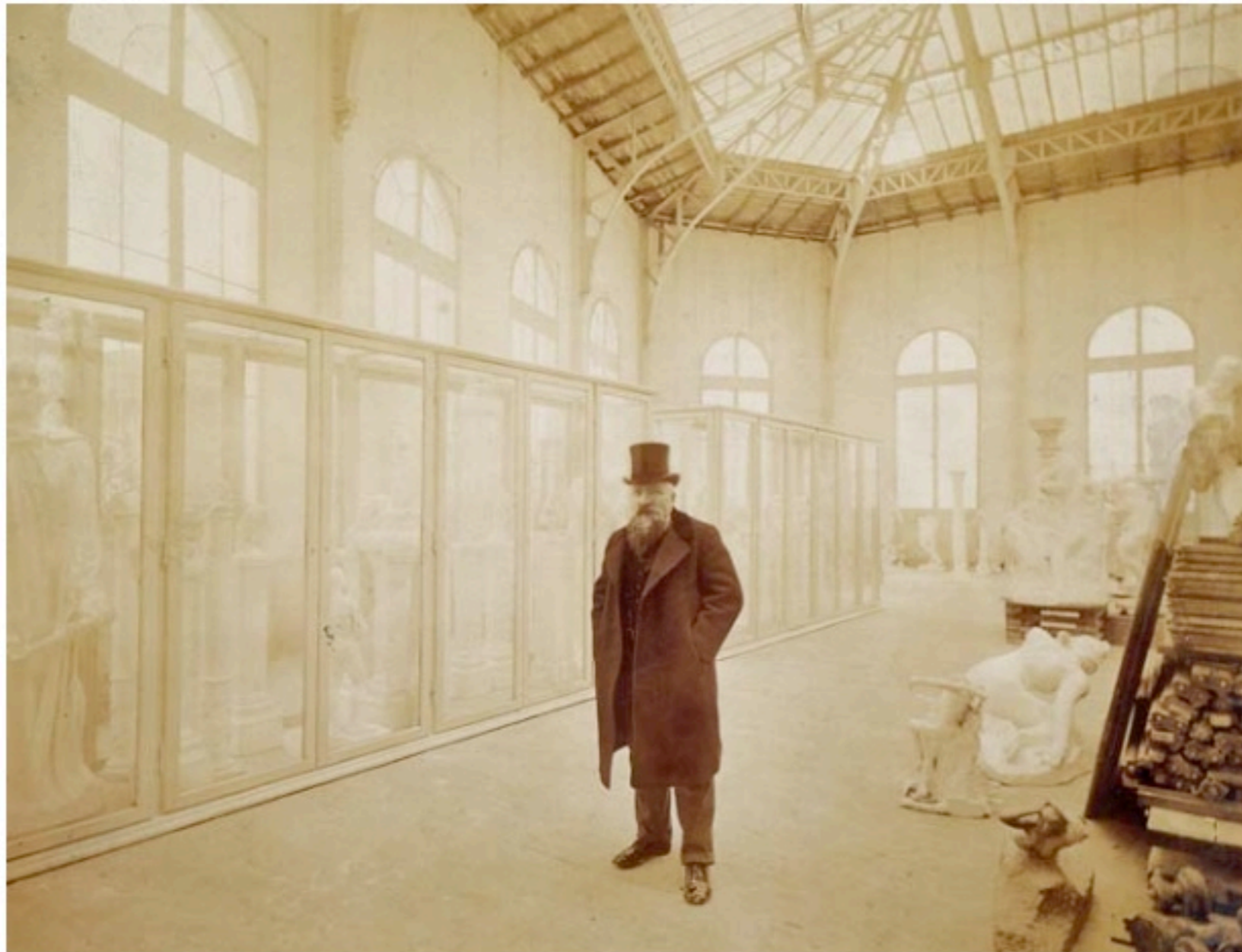
M. Bauche, Rodin in the Pavillon de l'Alma, 1900